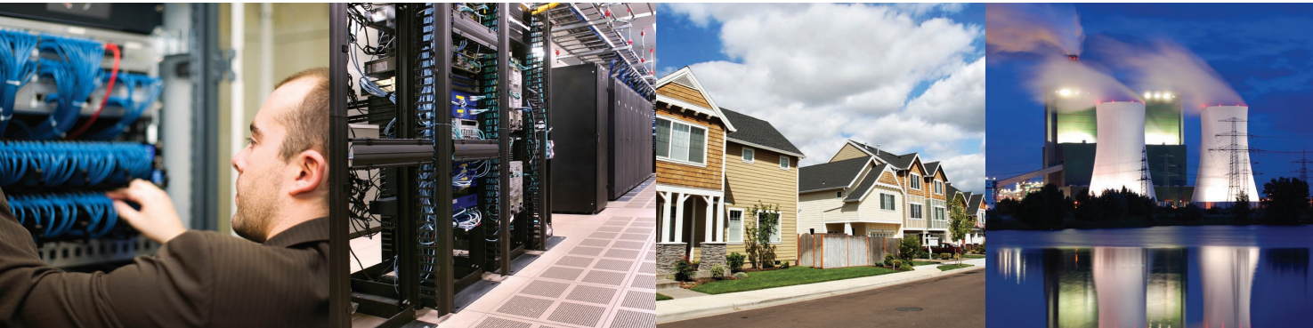
Reliable, cost-effective and secure. IPC - modular agility.

During an era of financial uncertainty, Cable Ways can offer the reliable, cost effective solutions you demand. With easy to install and flexible rack formats, the IPC range is your one-stop-shop for all of your cabinet needs.